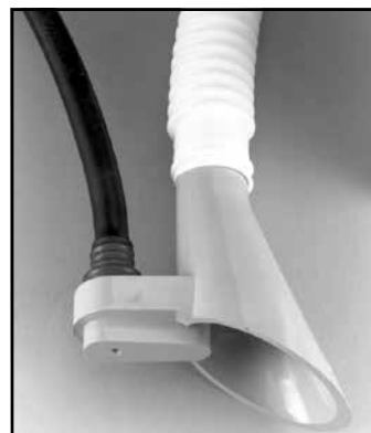
Sand Vac 542090

CALIFORNIA PROPOSITION 65 WARNING ⚠️ WARNING: Cancer and Reproductive Harm. ⚠️ AVERTISSEMENT: Peut Causer le Cancer et des Dommages au Système Reproducteur. ⚠️ ADVERTENCIA: Cáncer y Daño Reproductivo. www.p65warnings.ca.gov P652014A