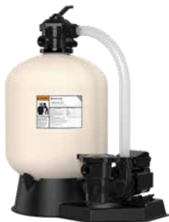
Sand Dollar Filter System 2

Our blow-molded process creates a one piece, non-corrosive tank of outstanding strength and durability. This pump and filter system provides excellent performance.