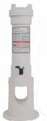
300 Series Chlorinator/ Feeder R171016