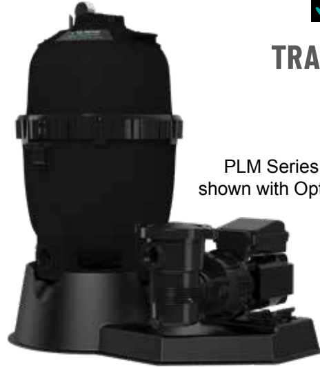
PLM Series Systems shown with OptiFlo® Pump 2

CALIFORNIA PROPOSITION 65 WARNING ⚠️ WARNING: Cancer and Reproductive Harm. ⚠️ AVERTISSEMENT: Peut Causer le Cancer et des Dommages au Système Reproducteur. ⚠️ ADVERTENCIA: Cáncer y Daño Reproductivo. www.p65warnings.ca.gov P65-2015-11