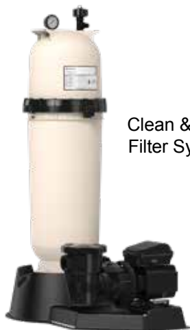
Clean & Clear Filter System 3

The Clean & Clear Filter System pairs the OptiFlo® Pump with the Clean & Clear Cartridge Filter, a quality filtration unit using a thermoplastic chemical-resistant tank. All models are equipped with easy spin-on unions for plumbing hookups.