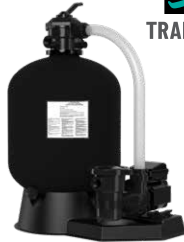
Cristal-Flo II Filter System shown with OptiFlo® Pump 2