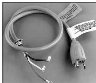
3 ft. Twist Lock cord 155234