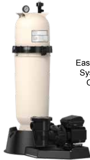
EasyClean D.E. Filter System shown with OptiFlo® Pump 3

Rugged, efficient and simple to operate. The EasyClean D.E. Filter System comes in a variety of sizes to suit most aboveground pool configuration.