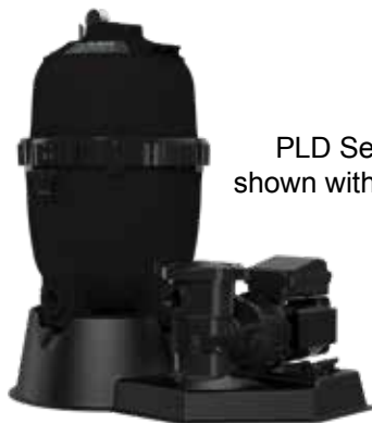
PLD Series Systems shown with OptiFlo® Pump 2

Evolution of the proven modular media technology delivers D.E. filtration in a simple, one-piece module design. Available with the rugged, large-capacity OptiFlo Series pump.