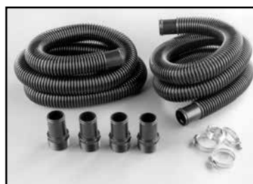
6 ft. Hose Kit 155151 12 ft. Hose Kit 155005